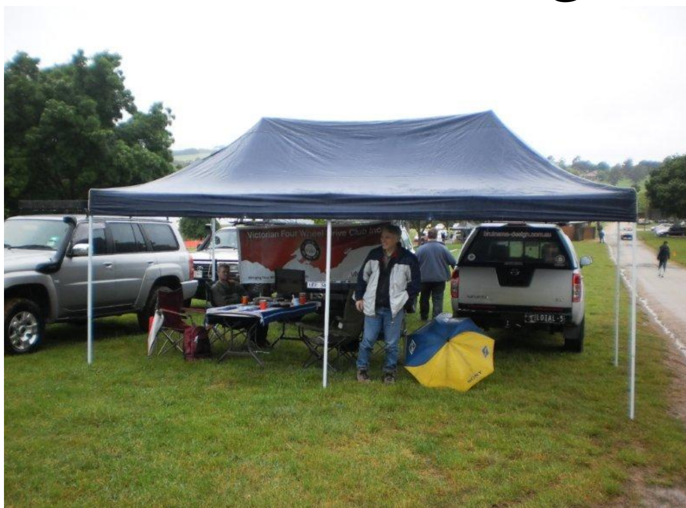
VFWDC Display at Rally Victoria